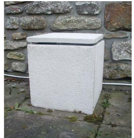
Concrete cube enclosure with top vent for a fan-assisted sump system

If budget constraints are not an issue then there really are no limits to the design of